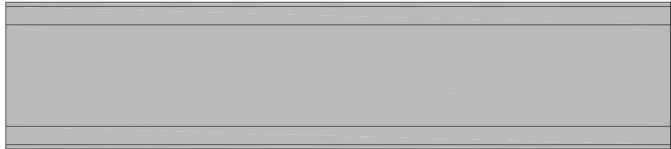
Top Down View

Weight: 25 Lbs. Related Castings: AIC-501-503, AIC-504-516, AIC-555 AIC-660-661